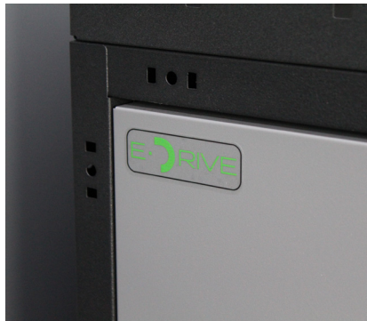
Danilift A/S reserves the right to change technical information without notice.